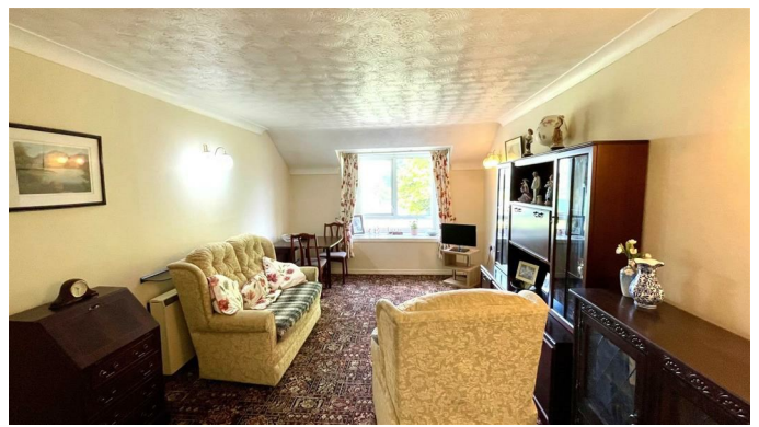
VIEW FROM THE LOUNGE

Upvc box bay window with views towards the park, tennis courts . Economy 7 heater, coving, 3 wall light points, security intercom