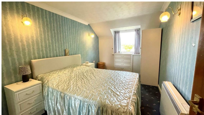
BEDROOM 13'5" x 8'10" (4.10m x 2.70m)

Plus built-in wardrobe with mirrored bi-fold doors, Economy 7 heater, views over the tennis court.